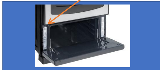
Location of model and serial number label (gas range)

Hazard: The ranges could become unstable and tip over if a heavy weight is placed on an open oven door, posing a risk of death or burns from spilling hot food or liquids.